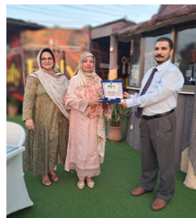
Clicked at the event